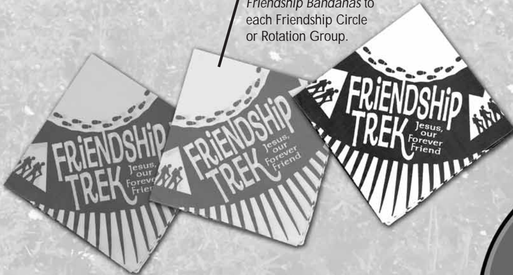
Give different colors of Friendship Bandanas to each Friendship Circle or Rotation Group.