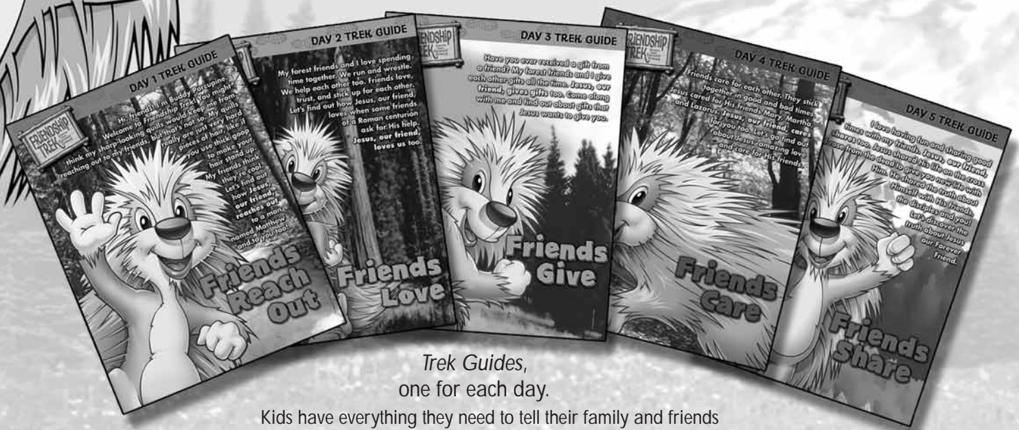
Trek Guides, one for each day.

Kids have everything they need to tell their family and friends about Jesus when they take these guides home.