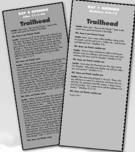
Kids read the Bible story Scripture at Trailhead Opening, before rotation sites.