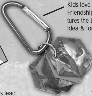
Kids love collecting Friendship Flips at Friendship Summit Closing. Each features the Bible memory verse, Main Idea & forest friend of the day.