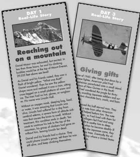
Friends discuss Real-Life Stories at Backpack Snacks.