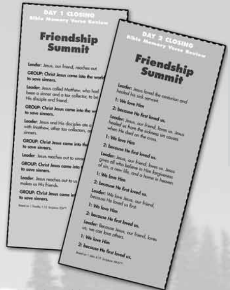
Kids review the Bible memory verse at Friendship Summit Closing. What a great way to reinforce God's Word!